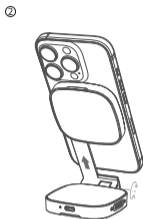
Fill Light Phone Holder Demo